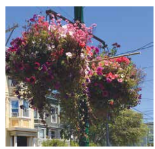
The Noe Valley Association has provided over 13 years of Cleaning, Greening and Improving Public Space in Noe Valley